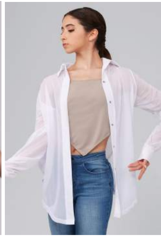
button down shirt